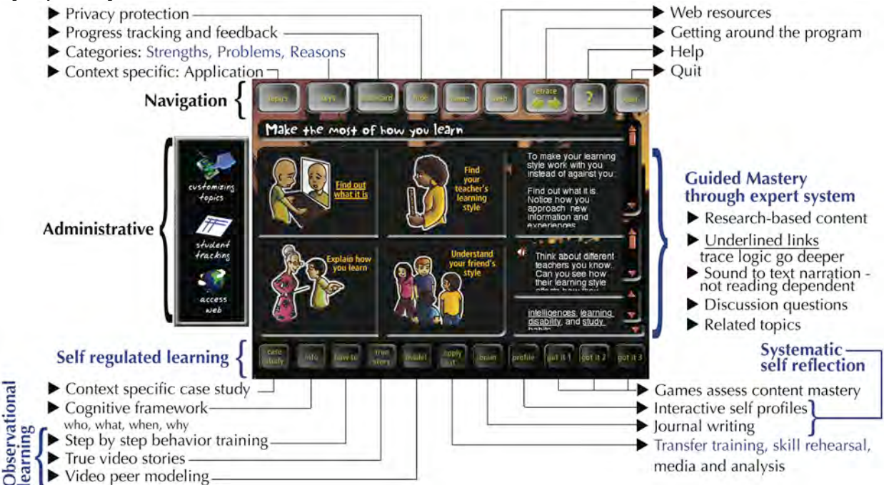
Figure 2: Diagram of the Whole Spectrum Self-Regulated Learning System

Learning process. Independent of specific content, the Whole Spectrum Self-Regulated Learning System that powers Ripple Effects SEL software (Figure 2) contains elements that have been linked to successful development of self-efficacy: guided mastery, self-regulated learning, observational learning, systematic self-reflection, transfer training, and skill rehearsal (Bandura, 1997; Pajares & Urdan, 2006). All of these modes of learning are introduced with a case study scenario (context-specific application). Additional elements of the system include continuous assessment of content mastery through interactive games; reading independence through peer narration and illustrations; narrative/story as teaching tool, including first person video true stories; and, positive reinforcement for completion of the learning process through a video game style point system.