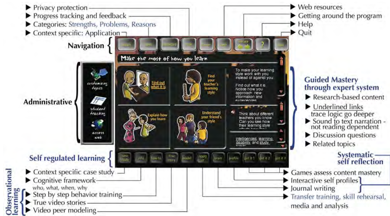
Figure 2: Diagram of the Whole Spectrum Self-Regulated Learning System

Implementer training. A Ripple Effects trainer provided the non-professional implementers with one three-hour training session, during which they became familiar with how the software worked, created their site-specific scope and sequence, and learned how to monitor student electronic scorecards for completion of required tutorials. They were not trained in, did not deliver, and did not facilitate discussion of any of the assigned content.