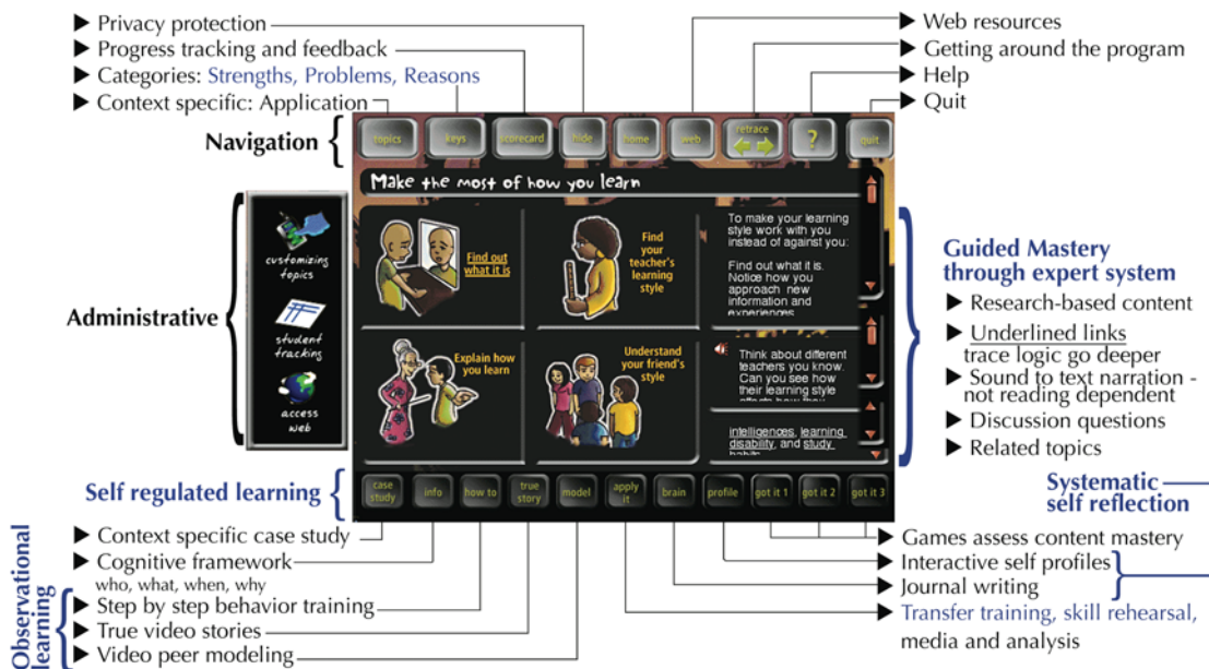
Figure 2: Diagram of the Whole Spectrum Self-Regulated Learning System

Implementer training. A Ripple Effects trainer provided four teachers with a single three-hour training session to orient them to the software, choose their site-specific tutorials, and prepare them to introduce the software to students, assign the tutorials, and use the built-in data management system to monitor compliance and track student progress. Ultimately, only one of the four trained staff facilitated all student participation in the intervention.